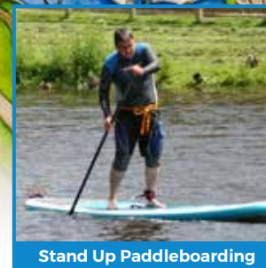
Stand Up Paddleboarding