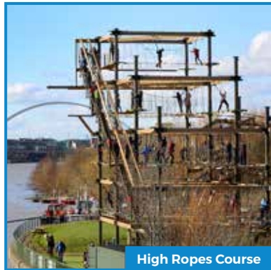
High Ropes Course

We pride ourselves on delivering a fantastic experience for any occasion and can cater for everyone regardless of their budget or group size.