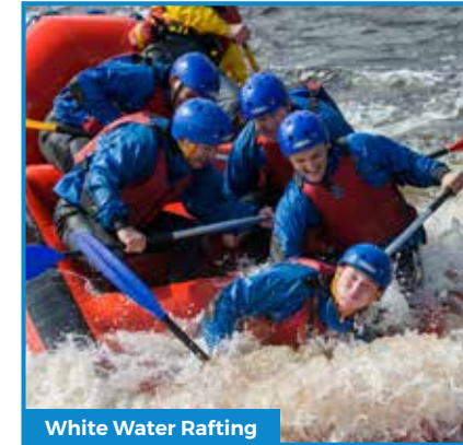
White Water Rafting