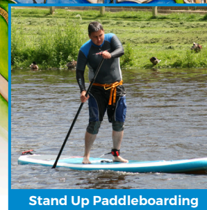
Stand Up Paddleboarding