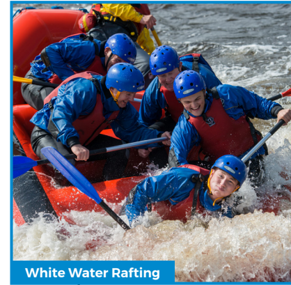
White Water Rafting