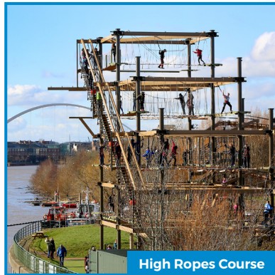
High Ropes Course

We pride ourselves on delivering a fantastic experience for any occasion and can cater for everyone regardless of their budget or group size.